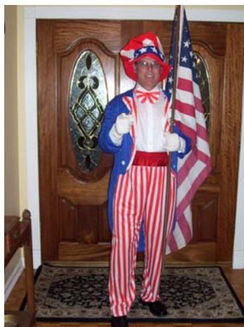
I want you to give Quality Care!

The keys to our success include our management stability, continuous quality improvement and consistent assignment of staff. We have 22 employees who have worked at Hy-Lond Home since the 1980s! One of our committed employees has been here since 1968! Our vision is to make Hy-Lond Home a great place and every day and every way we are taking the steps to get there!