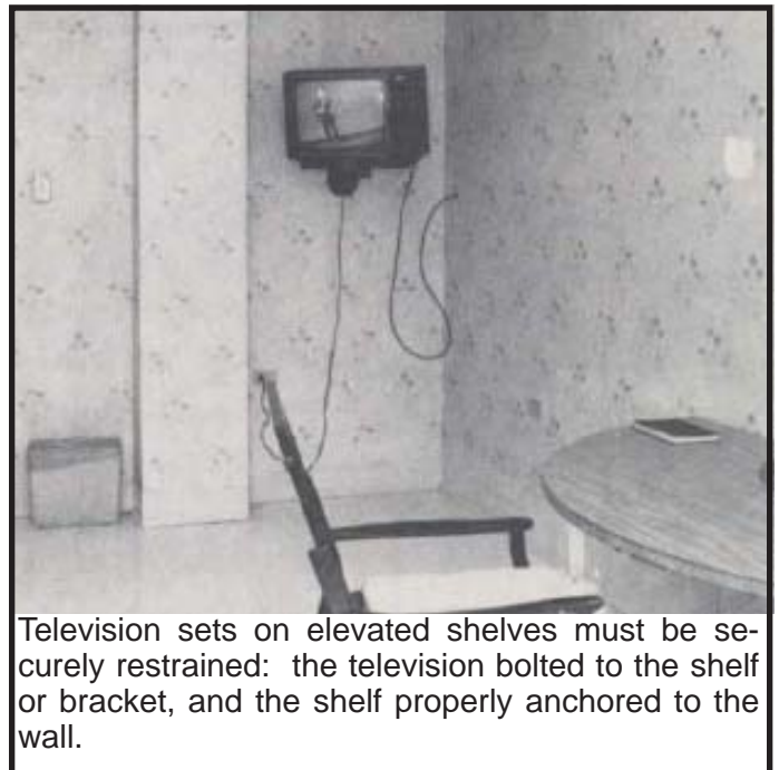
Television sets on elevated shelves must be securely restrained: the television bolted to the shelf or bracket, and the shelf properly anchored to the wall.

The higher the object, the greater the hazard. An object such as a heavy aquarium on a shelf four feet off the floor is a greater hazard than the same item located on a shelf only two feet high.